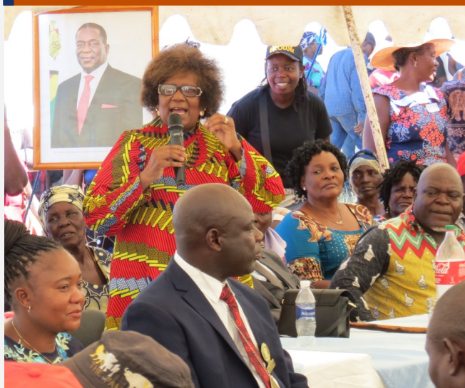
Senator P. Mupfumira