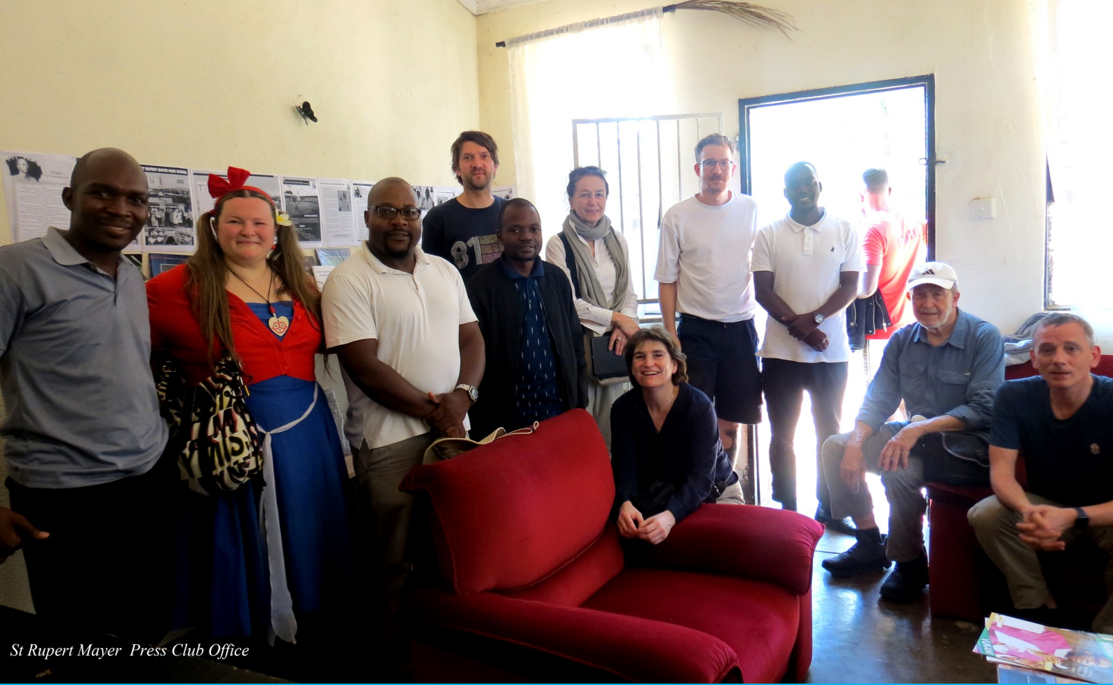
St Rupert Mayer Press Club Office