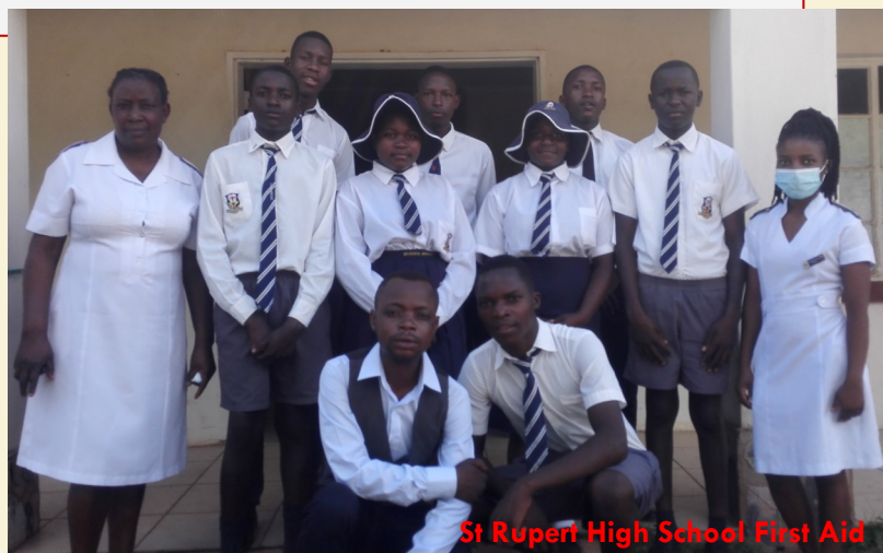
St Rupert High School First Aid

As a department we are specialised in rehabilitating clients with physical problems in order to bring them to normal , that is to the functional position considered normal for a human being. There is a lot of therapy sessions which are being done in the department to assist patients and clients in our community.