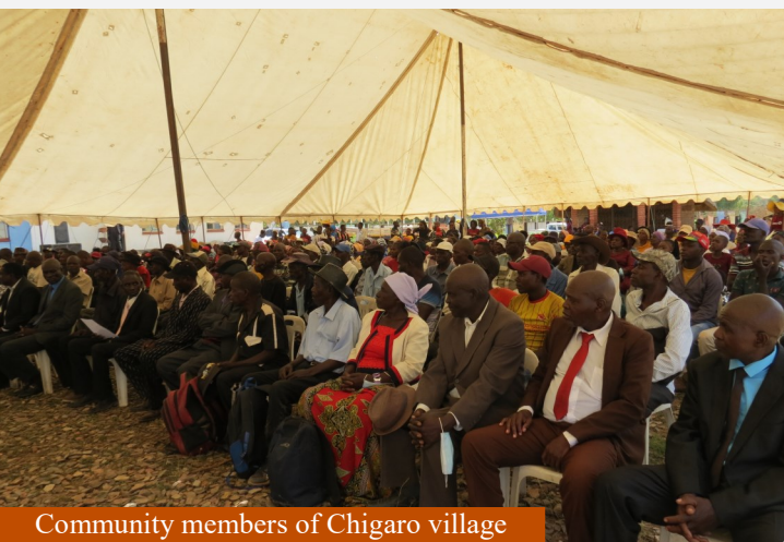
Community members of Chigaro village