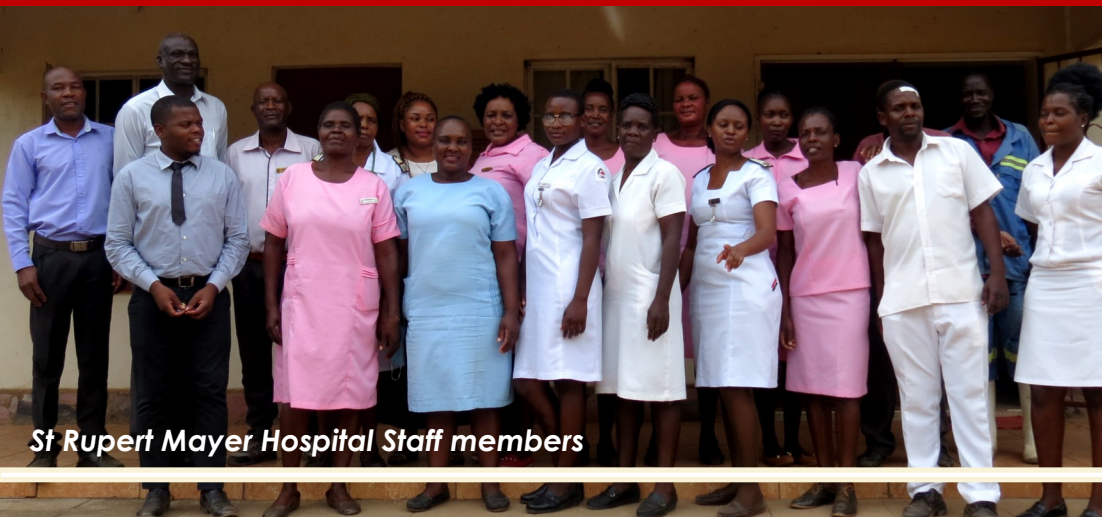
St Rupert Mayer Hospital Staff members

"The hospital provides opportunities for Nurse Aide students and they always get placements from time to time"